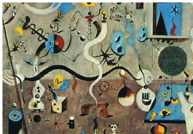
Figure 1 The Carnival of harriquin

Art is a kind of social ideology, which is created in various forms to meet the spiritual needs of human beings. From the definition of art: "Art is the creation of aesthetic objects, environments and experiences that can be shared with others by skill and imagination", it can be seen that no matter what form of art is closely related to human life, artists use their works of art to reflect and express their own feelings in real life, and meet the needs of human beings for artistic aesthetics [5]. In "Harriquin's Carnival" by Miró, the representative of surrealism, as shown in Figure 1, a peculiar sense of spatial reversal is depicted. There are fanatical gatherings in the room, and only humans are sad.